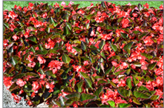
Big Red Bronze Leaf Begonia in bloom

Big Red Bronze Leaf Begonia is a fine choice for the garden, but it is also a good selection for planting in outdoor containers and hanging baskets. It is often used as a 'filler' in the 'spiller-thriller-filler' container combination, providing a mass of flowers and foliage against which the larger thriller plants stand out. Note that when growing plants in outdoor containers and baskets, they may require more frequent waterings than they would in the yard or garden.