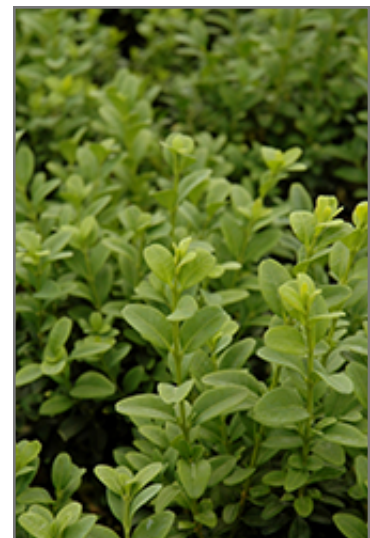
Julia Jane Boxwood foliage