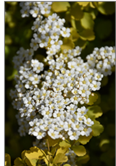
Glow Girl Birch Leaf Spirea flowers