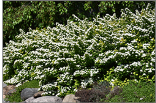
Glow Girl Birch Leaf Spirea in bloom

Glow Girl Birch Leaf Spirea is recommended for the following landscape applications;