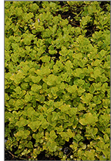
Golden Creeping Jenny foliage

Golden Creeping Jenny is recommended for the following landscape applications;