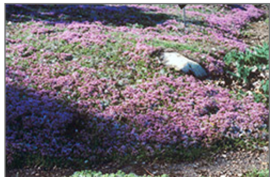
Mother-of-Thyme in bloom