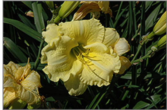
Gemini Daylily flowers