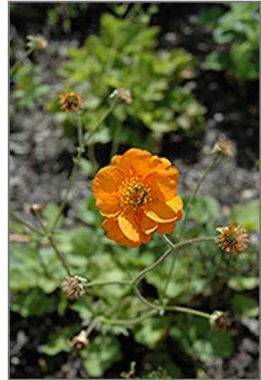
Dolly North Avens flowers