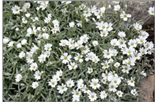
Snow-In-Summer flowers