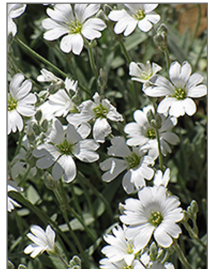
Snow-In-Summer flowers