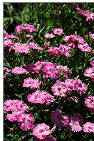
Blue Hills Pinks flowers