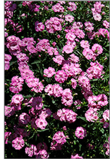
Blue Hills Pinks flowers

Blue Hills Pinks is recommended for the following landscape applications;