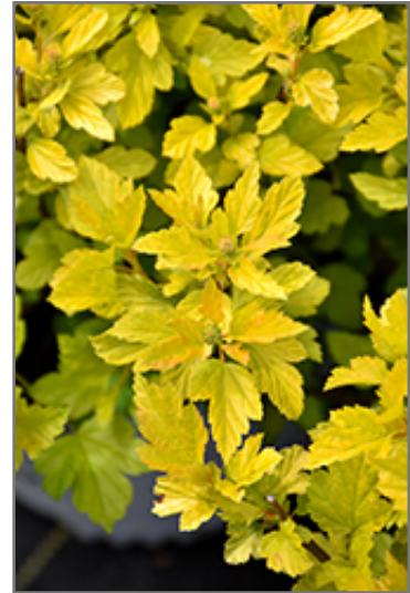
Tiny Wine Gold Ninebark foliage

Tiny Wine Gold Ninebark is recommended for the following landscape applications;