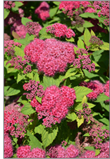
Double Play Red Spirea flowers

This shrub will require occasional maintenance and upkeep, and is best pruned in late winter once the threat of extreme cold has passed. It is a good choice for attracting butterflies to your yard, but is not particularly attractive to deer who tend to leave it alone in favor of tastier treats. It has no significant negative characteristics.