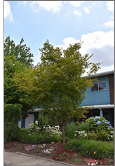
Northern Glow Maple

This tree does best in full sun to partial shade. It does best in average to evenly moist conditions, but will not tolerate standing water. It is not particular as to soil type or pH. It is somewhat tolerant of urban pollution. This particular variety is an interspecific hybrid.