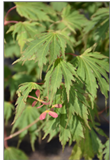
Northern Glow Maple foliage