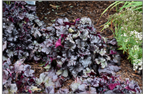
Black Pearl Coral Bells

Black Pearl Coral Bells is a fine choice for the garden, but it is also a good selection for planting in outdoor pots and containers. With its upright habit of growth, it is best suited for use as a 'thriller' in the 'spiller-thriller-filler' container combination; plant it near the center of the pot, surrounded by smaller plants and those that spill over the edges. Note that when growing plants in outdoor containers and baskets, they may require more frequent waterings than they would in the yard or garden.