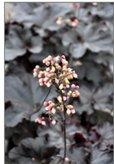
Black Pearl Coral Bells flowers