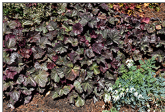
Northern Exposure Silver Coral Bells