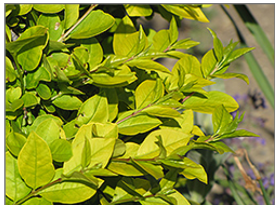
Golden Privet foliage