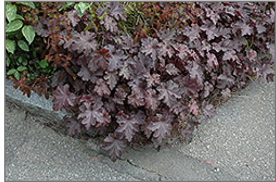
Stormy Seas Coral Bells

Stormy Seas Coral Bells is recommended for the following landscape applications;