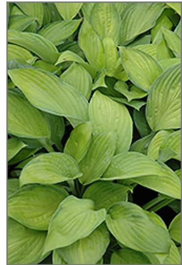
Gold Standard Hosta foliage

Gold Standard Hosta is recommended for the following landscape applications;