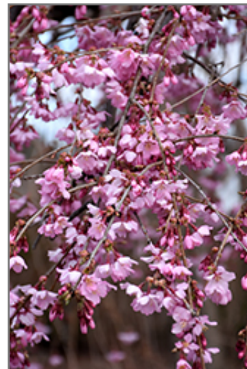
Pink Cascade Weeping Cherry flowers

Pink Cascade Weeping Cherry is recommended for the following landscape applications;