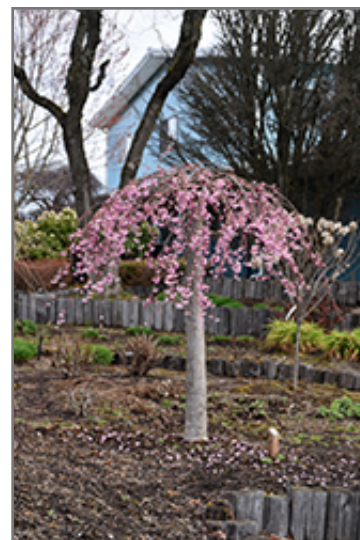
Pink Cascade Weeping Cherry in bloom