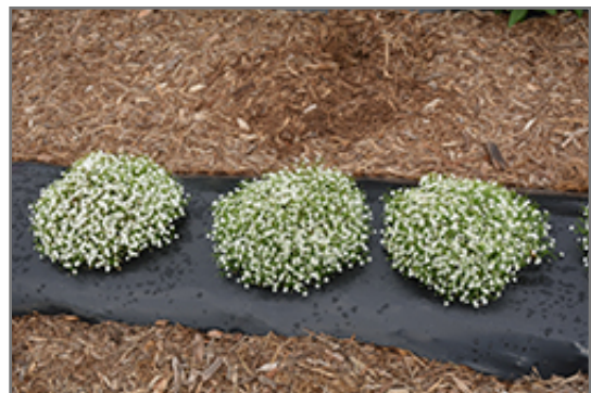
Gypsy White Baby's Breath in bloom