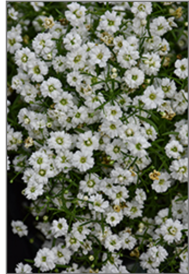
Gypsy White Baby's Breath flowers