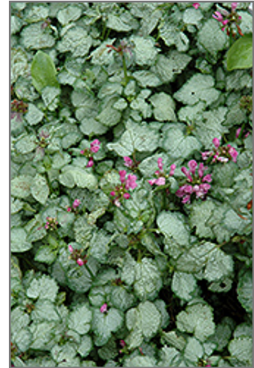
Beacon Silver Spotted Dead Nettle flowers