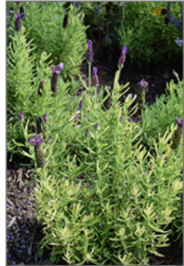
Javelin Forte Deep Purple Lavender in bloom

* This is a 'special order' plant - contact store for details