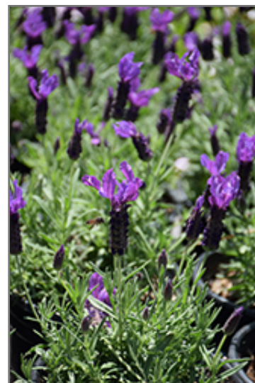
Javelin Forte Deep Purple Lavender flowers

Javelin Forte Deep Purple Lavender is recommended for the following landscape applications;