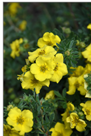
Cheesehead Potentilla flowers

Cheesehead Potentilla is recommended for the following landscape applications;