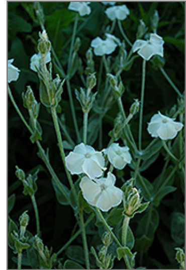
White Rose Campion flowers