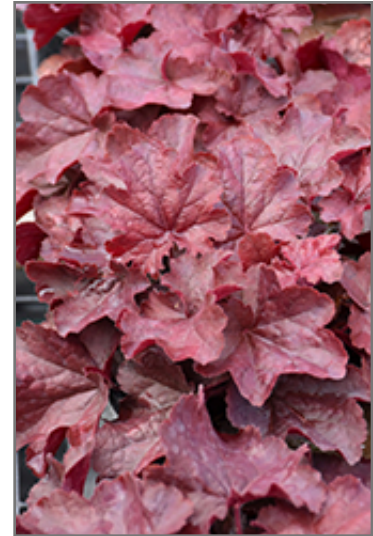
Northern Exposure Red Coral Bells foliage

Northern Exposure Red Coral Bells is recommended for the following landscape applications;