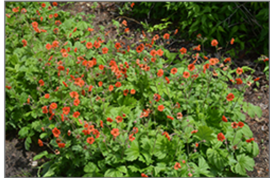
Rustico Orange Avens in bloom

Rustico Orange Avens is an herbaceous perennial with tall flower stalks held atop a low mound of foliage. Its relatively fine texture sets it apart from other garden plants with less refined foliage.