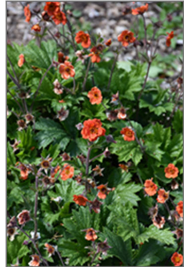
Rustico Orange Avens flowers

Rustico Orange Avens is a fine choice for the garden, but it is also a good selection for planting in outdoor pots and containers. It is often used as a 'filler' in the 'spiller-thriller-filler' container combination, providing a mass of flowers against which the larger thriller plants stand out. Note that when growing plants in outdoor containers and baskets, they may require more frequent waterings than they would in the yard or garden.