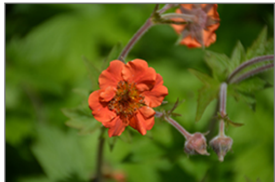
Rustico Orange Avens flowers