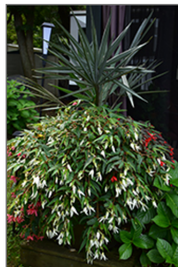
Summerwings White Begonia in bloom