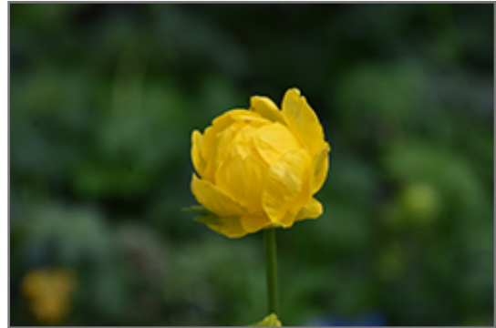
Lemon Queen Globeflower flowers