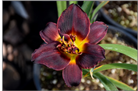
Voodoo Dancer Daylily flowers