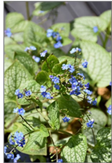
Jack of Diamonds Bugloss flowers

Jack of Diamonds Bugloss is recommended for the following landscape applications;