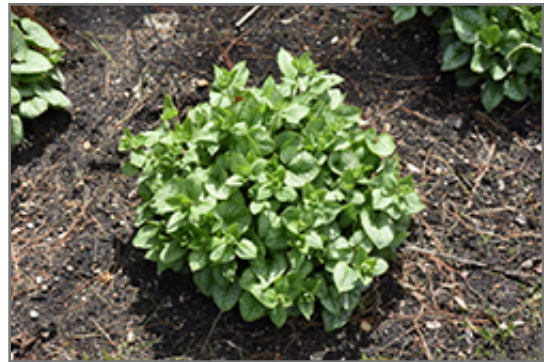
Jack of Diamonds Bugloss

Jack of Diamonds Bugloss will grow to be about 14 inches tall at maturity, with a spread of 30 inches. When grown in masses or used as a bedding plant, individual plants should be spaced approximately 28 inches apart. It grows at a medium rate, and under ideal conditions can be expected to live for approximately 10 years. As an herbaceous perennial, this plant will usually die back to the crown each winter, and will regrow from the base each spring. Be careful not to disturb the crown in late winter when it may not be readily seen!