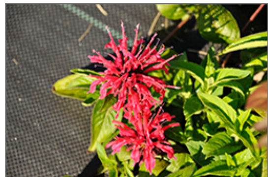
BeeMine Red Beebalm flowers