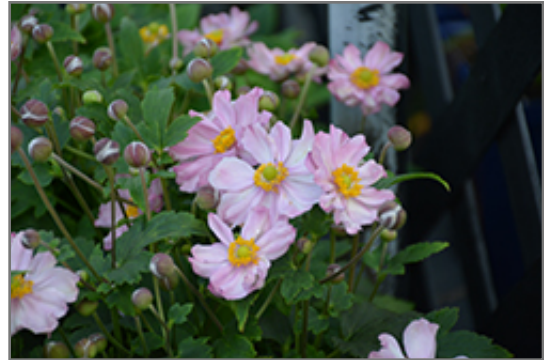
Fantasy Pocahontas Anemone flowers