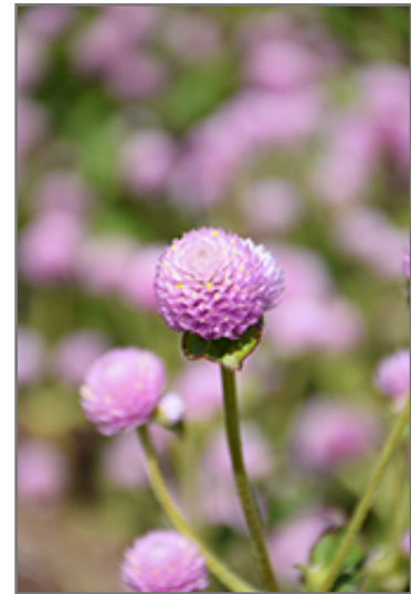
Gnome Pink Gomphrena flowers

This plant will require occasional maintenance and upkeep. Trim off the flower heads after they fade and die to encourage more blooms late into the season. It is a good choice for attracting bees and butterflies to your yard. It has no significant negative characteristics.