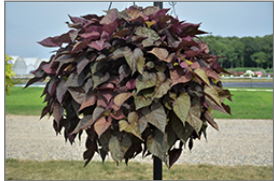
Floramia Rosso Sweet Potato Vine

Floramia Rosso Sweet Potato Vine is recommended for the following landscape applications;