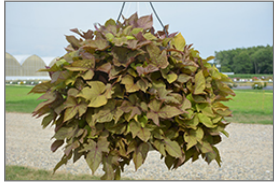
Floramia Verdino Sweet Potato Vine

Floramia Verdino Sweet Potato Vine will grow to be about 8 inches tall at maturity, with a spread of 24 inches. When grown in masses or used as a bedding plant, individual plants should be spaced approximately 20 inches apart. Its foliage tends to remain low and dense right to the ground. This fast-growing annual will normally live for one full growing season, needing replacement the following year.