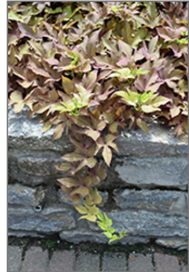
Floramia Verdino Sweet Potato Vine

Floramia Verdino Sweet Potato Vine is recommended for the following landscape applications;