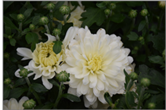
Bliss White Chrysanthemum flowers