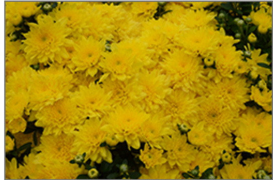
Blitz Lemon Chrysanthemum flowers