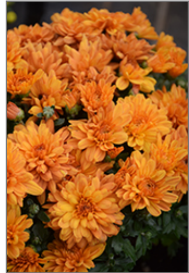
Goal Orange Chrysanthemum flowers