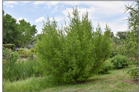
New Mexico Privet

This shrub will require occasional maintenance and upkeep, and is best pruned in late winter once the threat of extreme cold has passed. It is a good choice for attracting birds and bees to your yard. Gardeners should be aware of the following characteristic(s) that may warrant special consideration;