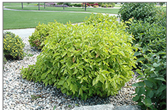
Prairie Fire Dogwood