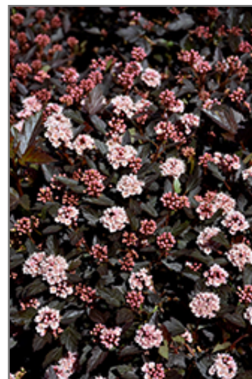
Little Joker Ninebark flowers