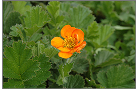
Fireball Aven flowers