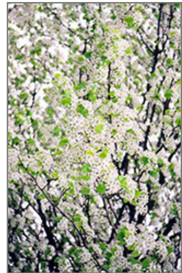
Bradford Ornamental Pear flowers