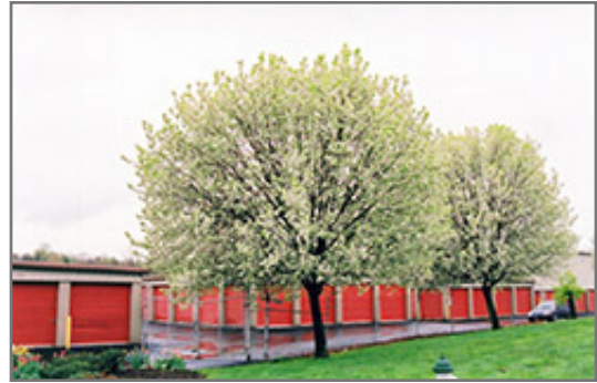
Bradford Ornamental Pear in bloom