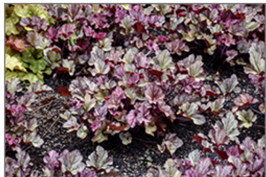
Coralberry Coral Bells