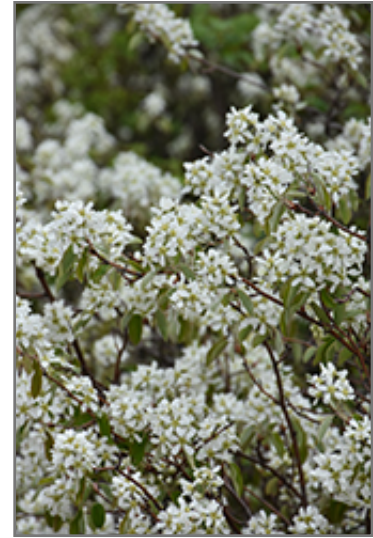
Saskatoon flowers

Saskatoon is a multi-stemmed deciduous shrub with an upright spreading habit of growth. Its relatively fine texture sets it apart from other landscape plants with less refined foliage.