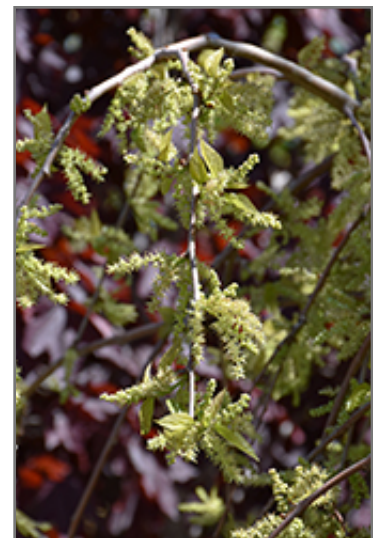
Chaparral Weeping Mulberry flowers