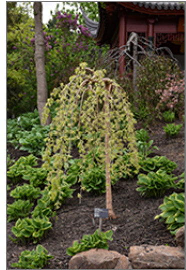
Chaparral Weeping Mulberry in bloom

This shrub performs well in both full sun and full shade. It is very adaptable to both dry and moist locations, and should do just fine under average home landscape conditions. It is considered to be drought-tolerant, and thus makes an ideal choice for xeriscaping or the moisture-conserving landscape. It is not particular as to soil type or pH, and is able to handle environmental salt. It is highly tolerant of urban pollution and will even thrive in inner city environments. This is a selected variety of a species not originally from North America.