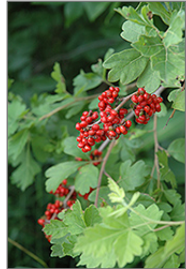
Fragrant Sumac fruit

Fragrant Sumac is recommended for the following landscape applications;