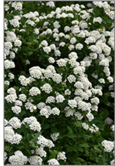
Tor Spirea flowers

This shrub should only be grown in full sunlight. It prefers to grow in average to moist conditions, and shouldn't be allowed to dry out. It is not particular as to soil type or pH. It is highly tolerant of urban pollution and will even thrive in inner city environments. This is a selected variety of a species not originally from North America.