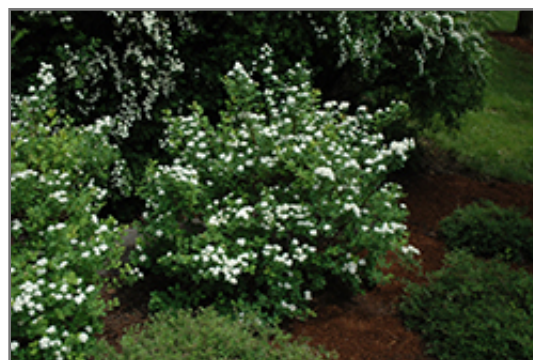
Tor Spirea in bloom