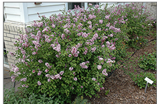
Prince Charming Lilac in bloom