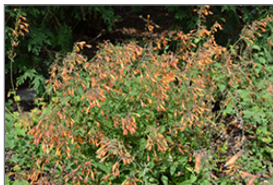
Apricot Sprite Hyssop in bloom