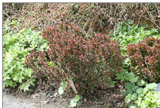
Bagatelle Japanese Barberry